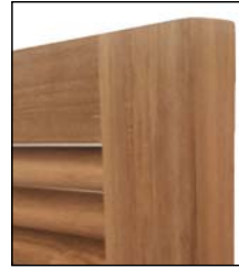
Solid, 1" thick Doors and Drawer Fronts