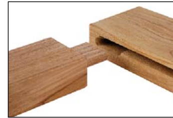
Precision, Mortis & Tenon Construction