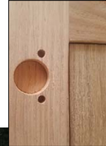
State of the Art, CAD Fabrication